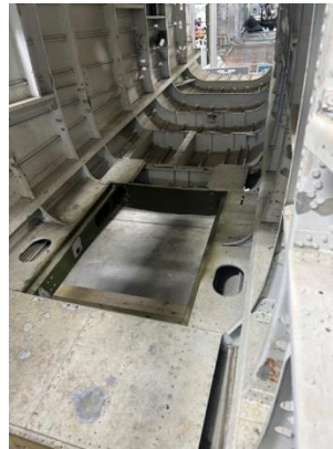
Rear of plane showing back hatch.